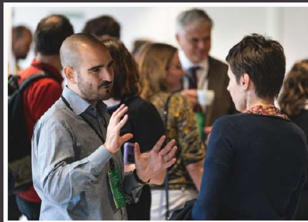
LIVE EVENTS ARE CRUCIAL FOR BUILDING NEW NETWORKS, AGROSERV KICKOFF 2023.

To achieve this, we are not solely relying on a magazine but will also develop our website, making it more dynamic with a news column and clearer sections for different interest groups. More events, both online and live are also important for staying connected and engaged.